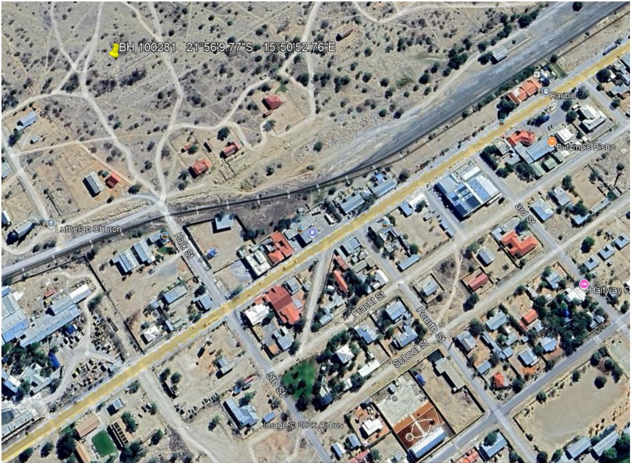
Fig 1. Satellite image of Karibib town BH 100281